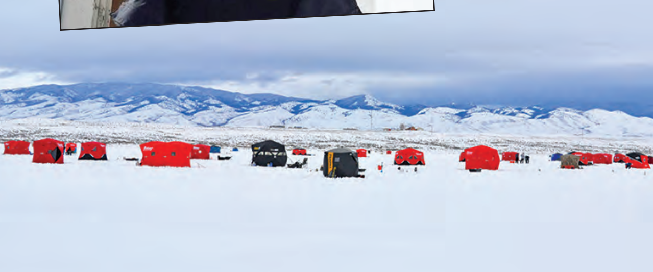
A wintery scene from Sunday's event.