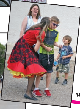
The Can-Can girls leave lipstick on several parade watchers.