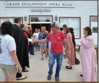
Cast and crew thank attendees for coming after the melodrama.