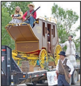
The GEM Stage line was on time.