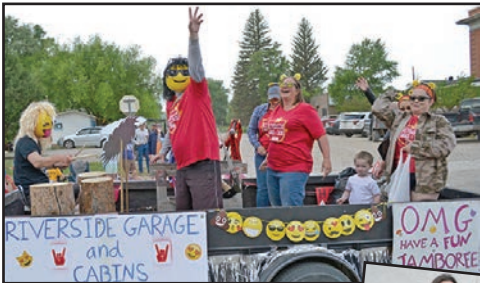
The Riverside Garage rockers spread cheer.