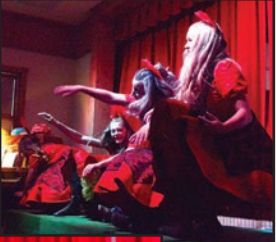
...then they fall down.