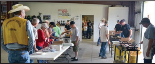
Above and Middle, The Encampment/Riverside Lions Club Pancake Breakfast was well attended Saturday as people came in waves.