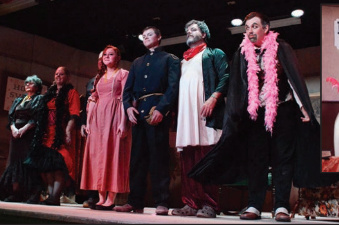
The cast of "He Lured Her to the Primrose Path" stand for applause Saturday night.

The Grand Encampment Opera Company presented "He Lured Her to the Primrose Path, But He Was Nipped in the Bud" Wednesday, Friday and Saturday.