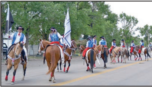
The Cheyenne Trotters Equestrian Team does crossovers when the parade slows. The Cheyenne Frontier Days Dandies wave.