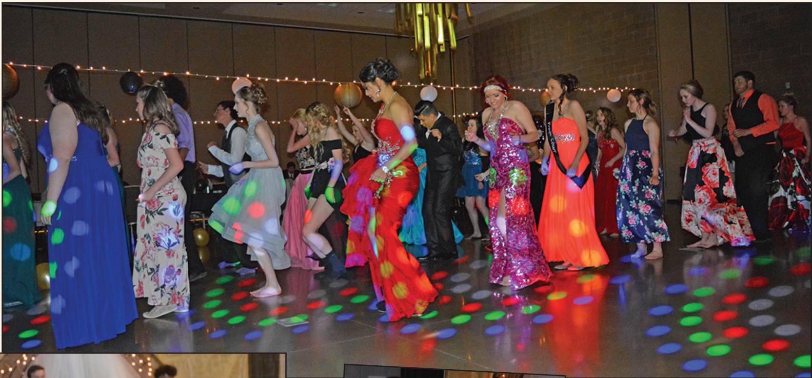
The dance gets started Saturday night at the PVCC as a group line dances to a popular song.

Saratoga Middle/High School held their Masquerade-themed Prom at the Platte Valley Community Center Saturday evening