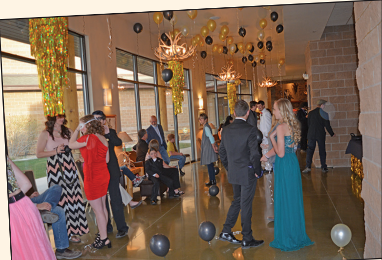
Attendees gather in the decorated hallway outside the Great Hall.