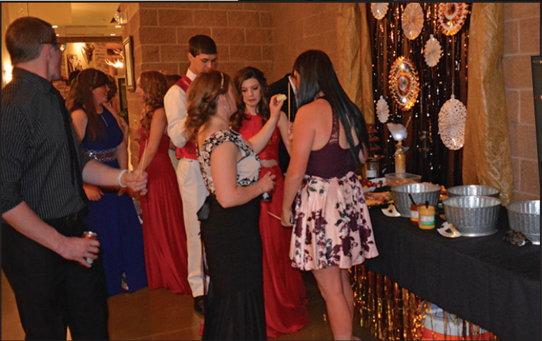
Refreshments were available in the hallway outside the Great Hall Saturday.