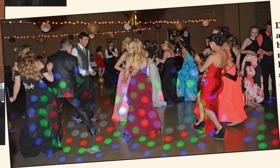
Dancers are bathed in multicolor lights as they dance the night away Saturday.