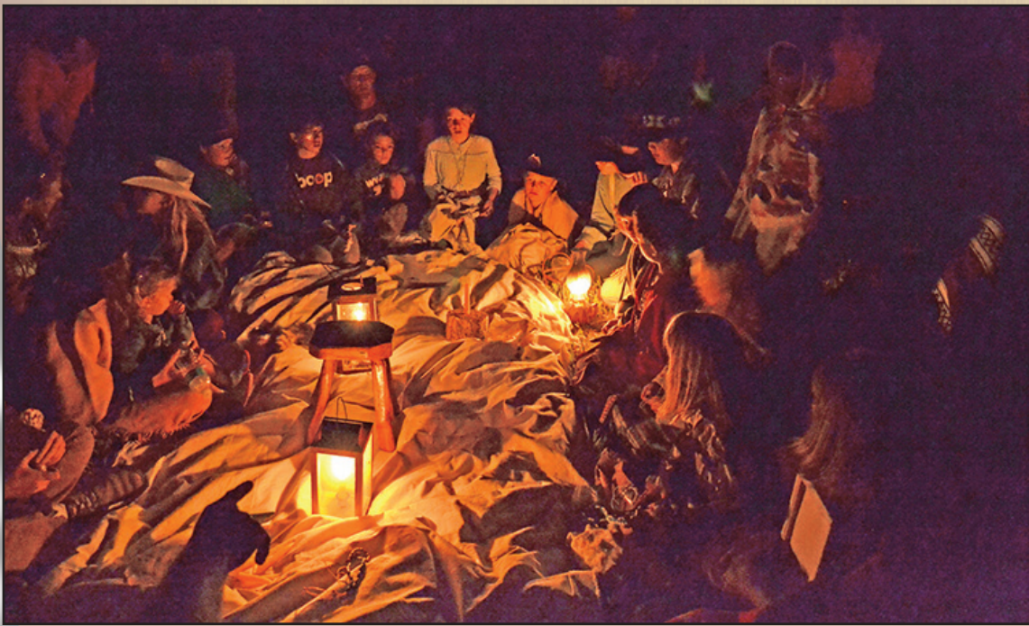
Children test their shrewdness during Saturday's last evening event, the Trading Blanket. Objects are put up by a trader and different items are offered in trade during the popular event.