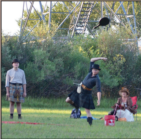
Guys get a chance to throw metal during Saturday's Skillet Toss.