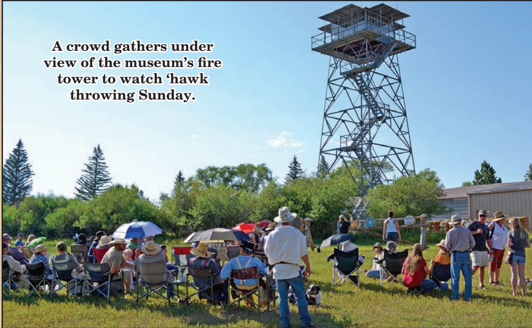
A crowd gathers under view of the museum's fire tower to watch 'hawk throwing Sunday.