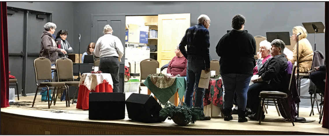
Members of the Encampment-Riverside Community Choir prepare to rehearse for the group's Christmas concert at the Encampment Opera House.