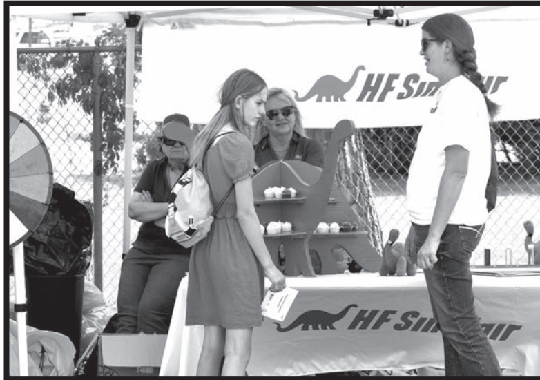
Sinclair had a busy booth on Energy Day August 1st.