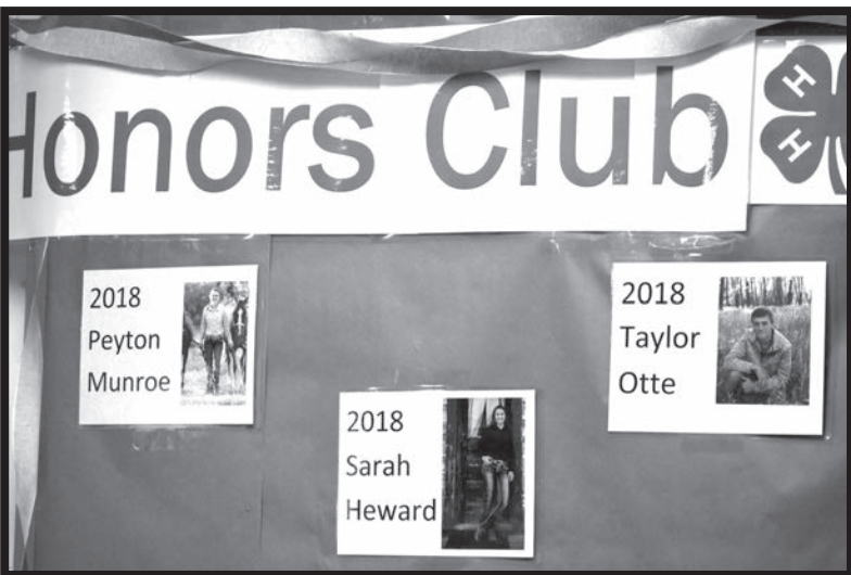
Honors from the past could be seen at the 2022 Carbon County Fair.