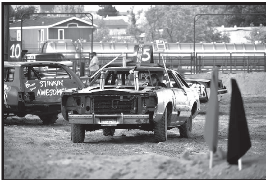
The Derby was on pause until the smoke cleared and the driver was out of the car.