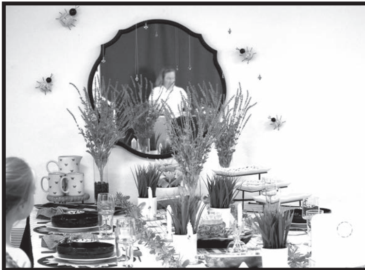
The Table Setting Contest scenes had many beautiful entries.