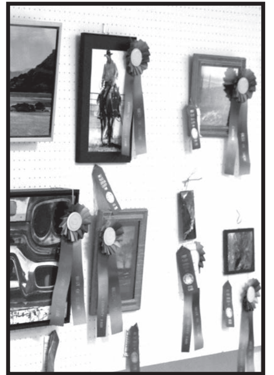
Awards were seen all over the exhibition hall.