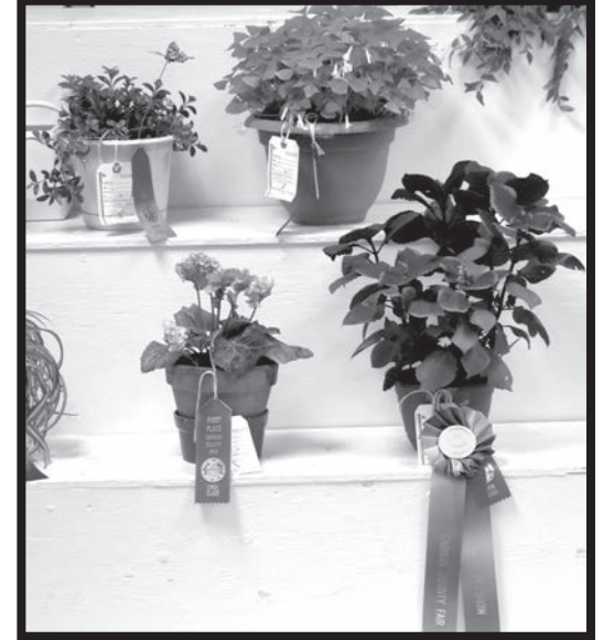
Blue ribbon plants were great to look at.