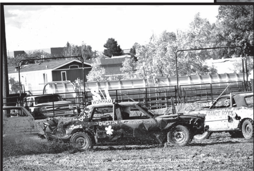
Crowd pleasing cars show off before the Derby started