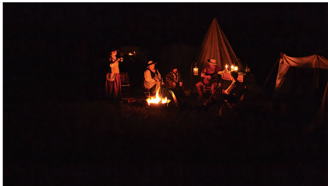
Campers seem to float in the darkness at the Mountain Man Rendezvous.